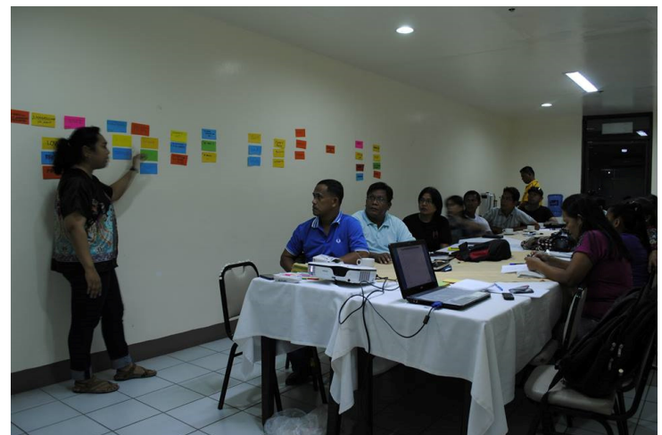
28-29 April 2014. The Ormoc Evangelical Disaster Response Network (OEDRN) held a two-day workshop on vision-casting.