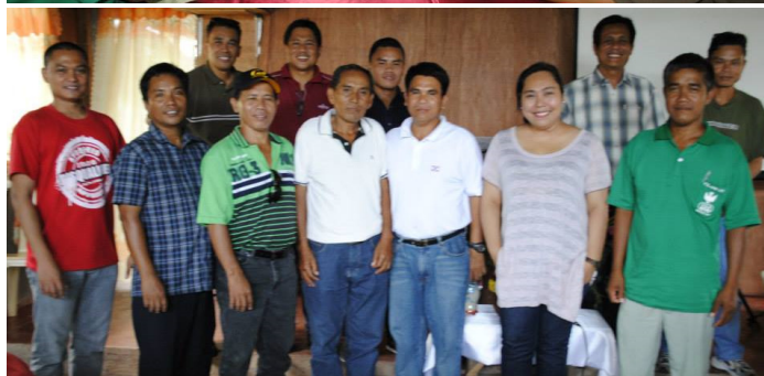
Top: Pastors and Christian leaders in Kananga, Leyte assess together their community needs in the aftermath of super-typhoon Haiyan that devastated their communities. Bottom: After doing self-evaluation and local resource inventory, the Christian leaders made a commitment to organize a local DRN.

Churches all over the Visayas Island came together in forming Disaster Response Networks (DRN). In obedience to the call of Jesus Christ to love our neighbors as we love ourselves, the DRNs were active in helping their communities on disaster risk reduction management, rehabilitation, peacebuilding, and reconciliation processes.