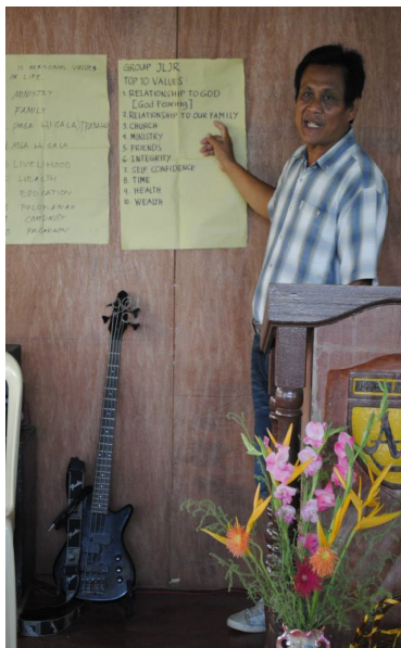
21 April 2014. The Kananga Disaster Response Network (KADRN) held a one-day workshop to help the officers and members create the vision and mission of their group.